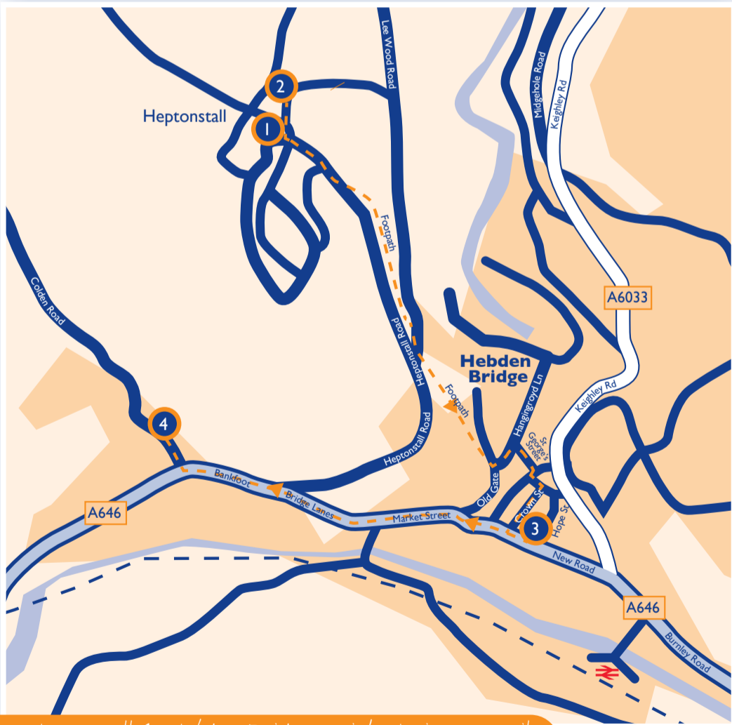
Heptonstall & Hebden Bridge Faith Heritage Trail