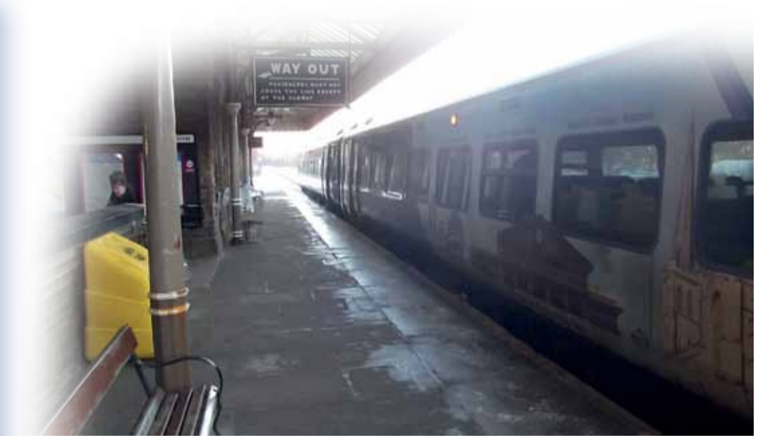
Calderdale Faith Heritage Rail Trail